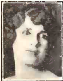
AIMEE SIMPLE McPHERSON

2:45 p. m.—Popular Melodies. 4:00 p. m.—Organ Echoes. 4:30 p. m.—Uncle Jay's Rhymes, Riddles and Songs. 8:00 p. m.—Interesting Interviews. 8:30 p. m.—Patsy and Tom, the Modern Pair. 9:00 p. m.—Highway Highlights.