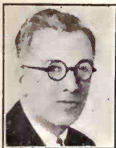
R. A. CASE

The essential features of these programs are identical with those sent us by the stations